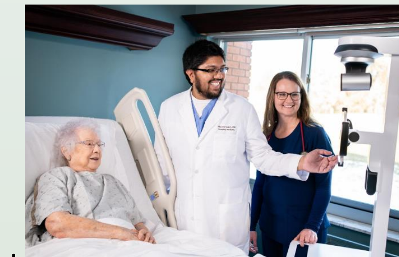
2023 Q1 TeleStroke Volumes

When a patient with stroke symptoms arrives at the emergency department, they receive immediate, hands-on care and assessment from the expert doctors and nurses on staff. Then, using TeleStroke technology, a board-certified neurologist is contacted immediately. After the neurologist examines the patient, they work with the emergency department physician to develop a treatment plan for the patient to ensure the best outcomes possible.